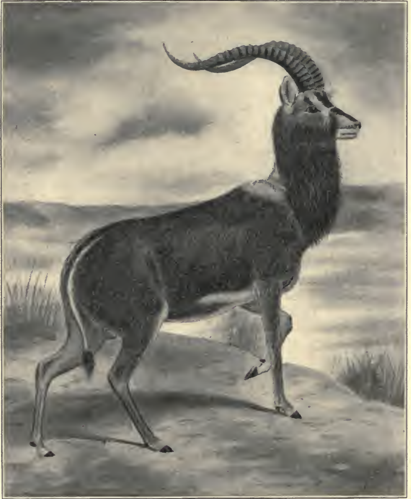
FIG. XIV. COBUS MARIA. MRS. GRAY'S WATERBUCK.

1. Adult ♂ P. West Africa. Rowland Ward & Co.